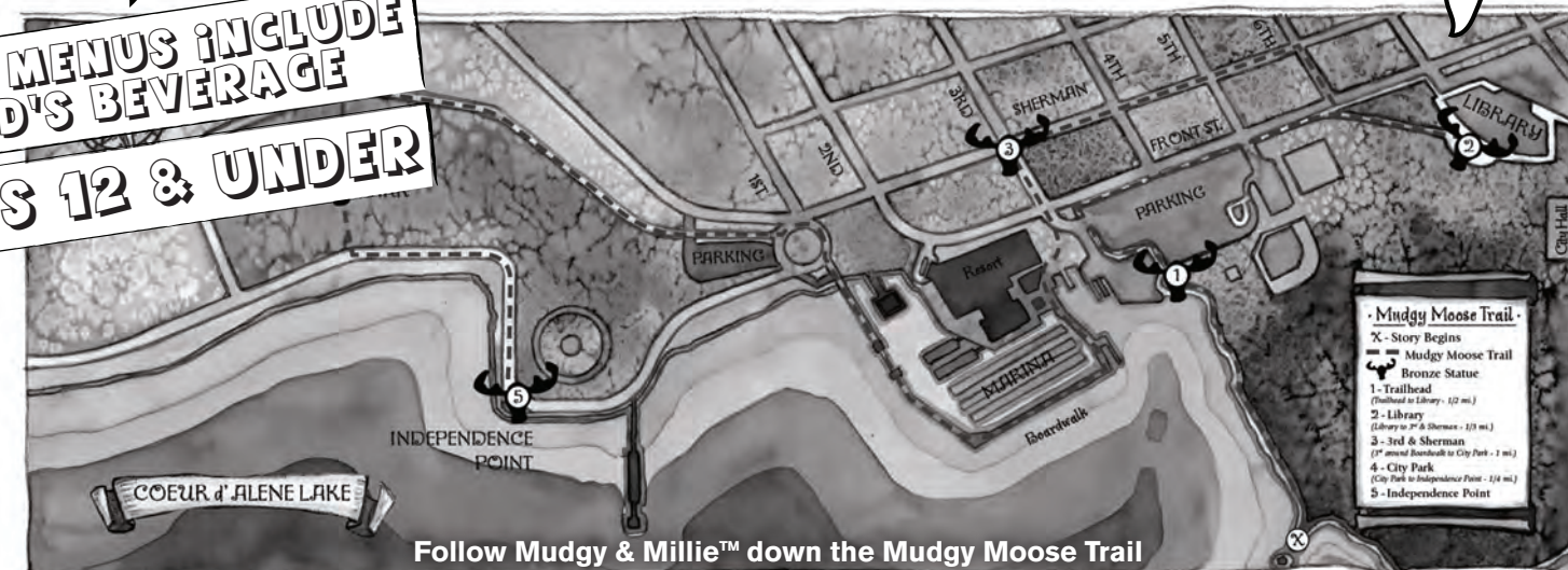
Follow Muddy & Millie™ down the Mudgy Moose Trail

KIDS MENUS INCLUDE KID'S BEVERAGE KIDS 12 & UNDER