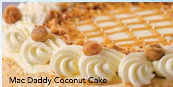
Mac Daddy Coconut Cake

Six layers of chocolate devil's food cake filled with rich dark chocolate mousse, with chocolate fudge icing, chocolate ribbons and served with chocolate ice cream and chocolate sauce. 9.50